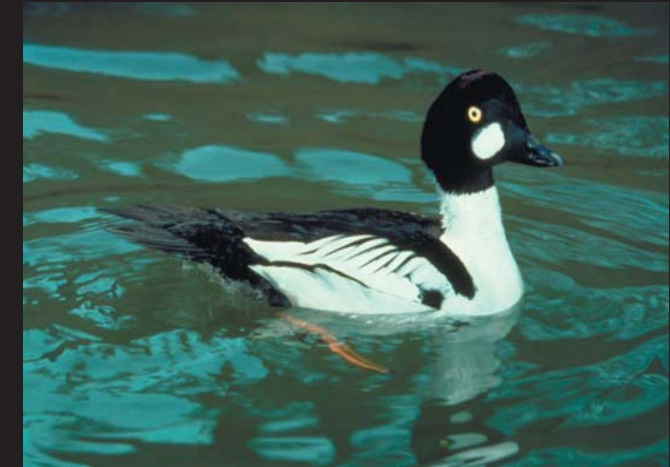
Common Goldeneye

planned wetting and drying cycles are used to increase the availability of food for area wildlife. Each summer, wetlands are drained and planted with millets, oats, and other food crops which go to seed before the arrival of fall migrants. These areas are then flooded, providing a home for wintering wildlife.