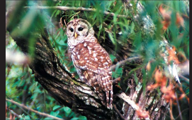
Barred Owl/Quincey Banks

historic monsters, swamps are simply diverse, rich habitats for wildlife. Follow the boardwalk into the Tupelo swamp to a world where life abounds with warblers, chickadees, and titmice in the trees, Green Herons stalking the shallows, and Wood Ducks dipping for snacks.